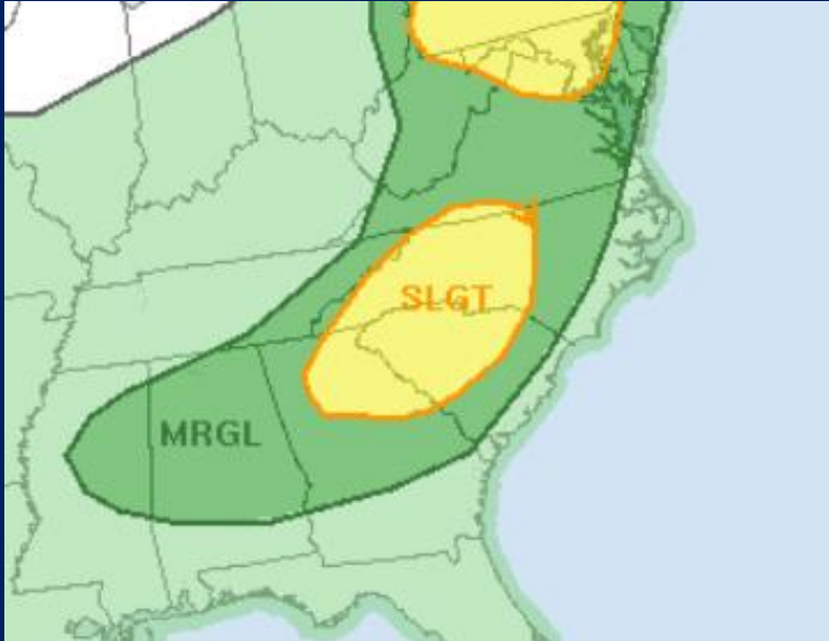
Slight Risk of Severe Storms Favored Near the I-95 Corridor After Nightfall