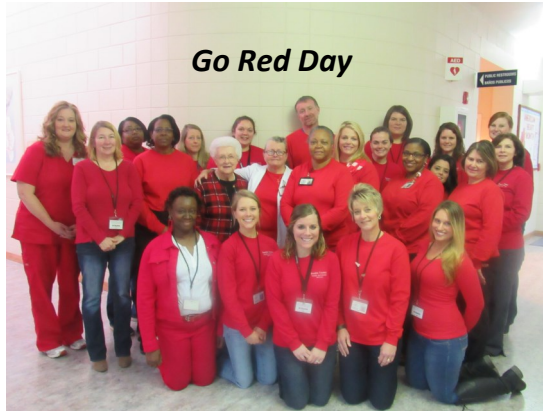
Go Red Day